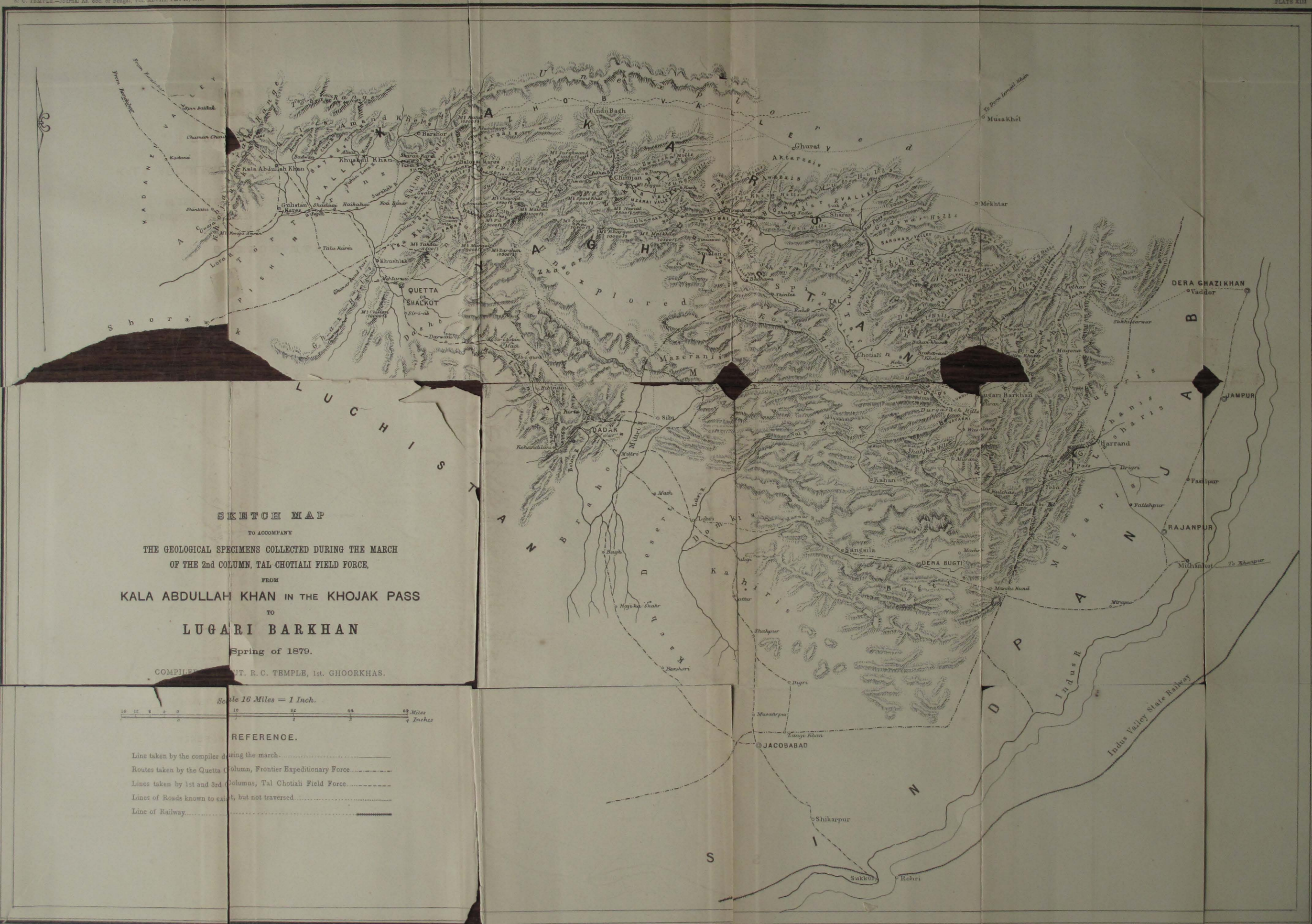
SKETCH MAP TO ACCOMPANY THE GEOLOGICAL SPECIMENS COLLECTED DURING THE MARCH OF THE 2nd COLUMN, TAL CHOTIALI FIELD FORCE, FROM KALA ABDULLAH KHAN IN THE KHOJAK PASS TO LUGARI BARKHAN Spring of 1879. COMPILED BY LT. R. C. TEMPLE, 1st. GHOORKHAS.